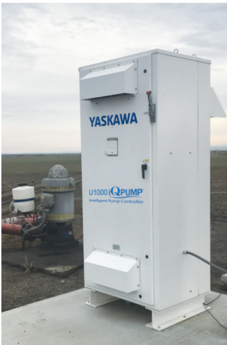
150HP @ 480VAC Nema-3R Package